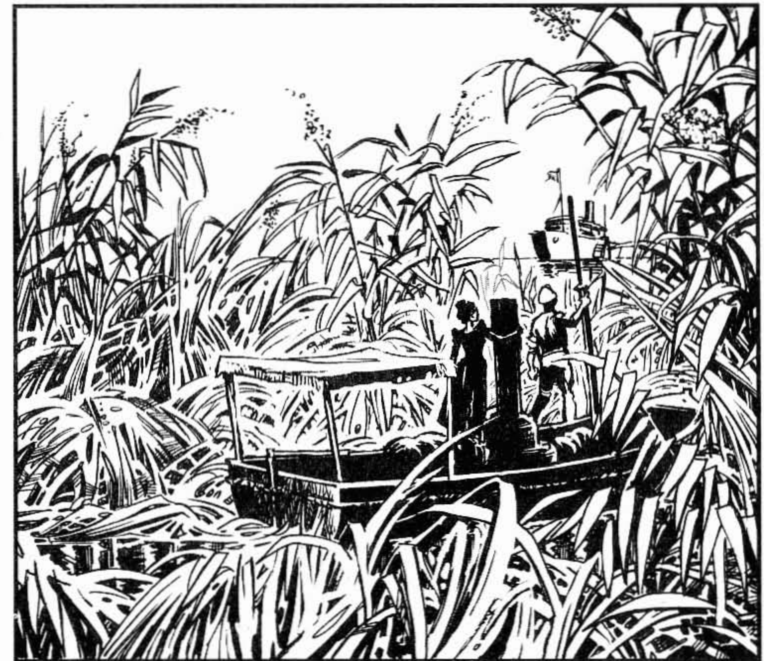
They watched the Königin Luise from their hiding-place.

'Look, they're going a different way now!' said Rose