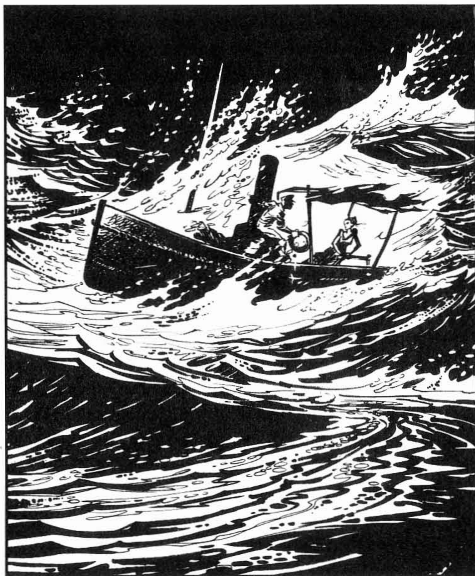
Rose fought with the tiller, and Allnutt rushed back to help her.

The African Queen went down, and the brave attempt to torpedo the Königin Luise for England failed. As the old boat disappeared under the waves, the storm died away and soon the waters of the lake were once more smooth and calm.