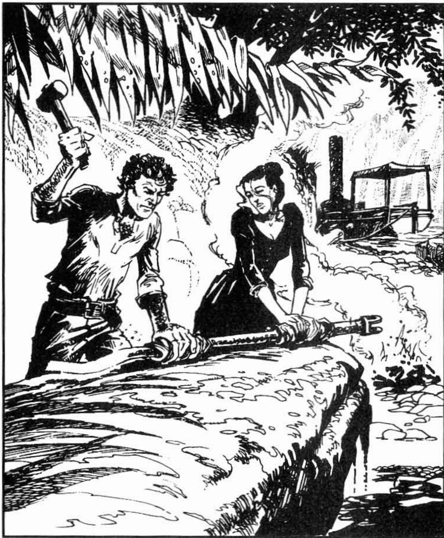
It was a week of back-breaking and dangerous work.

Rose was so full of hope, and so sure that Allnutt could do it that in the end he agreed to try. He put his doubts to one side, and they started almost a week of back-breaking, and