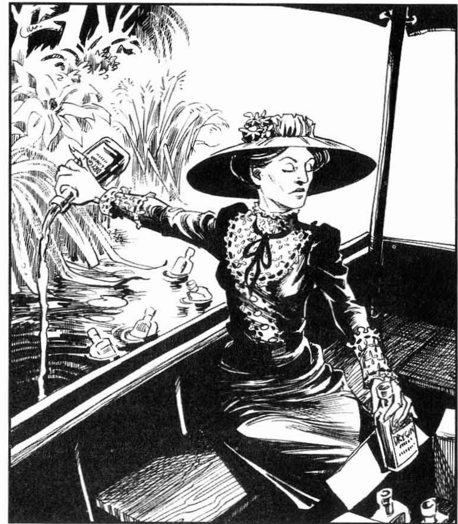
Rose was emptying all the gin bottles over the side of the boat.

Rose went on calmly with her sewing, while Allnutt spent some time repairing the boiler and the engine. But when he had washed all the oil off himself, there was nothing left to do. And all round him was the silence of the river, which in itself was enough to make him feel lonely and uncertain.