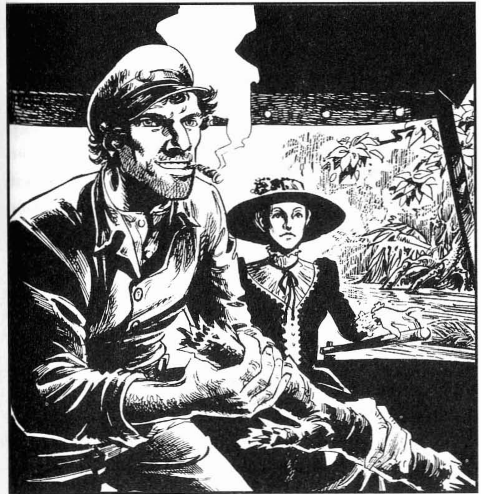
Allnutt kept a careful eye on the river ahead.

Rose silently took hold of the tiller; it was so hot that it seemed to burn her hand. She began to enjoy feeling the boat move obediently as she put the tiller to one side or another, while Allnutt put more wood on the fire, and kept a careful eye on the river ahead. Plants grew thickly on the muddy bed