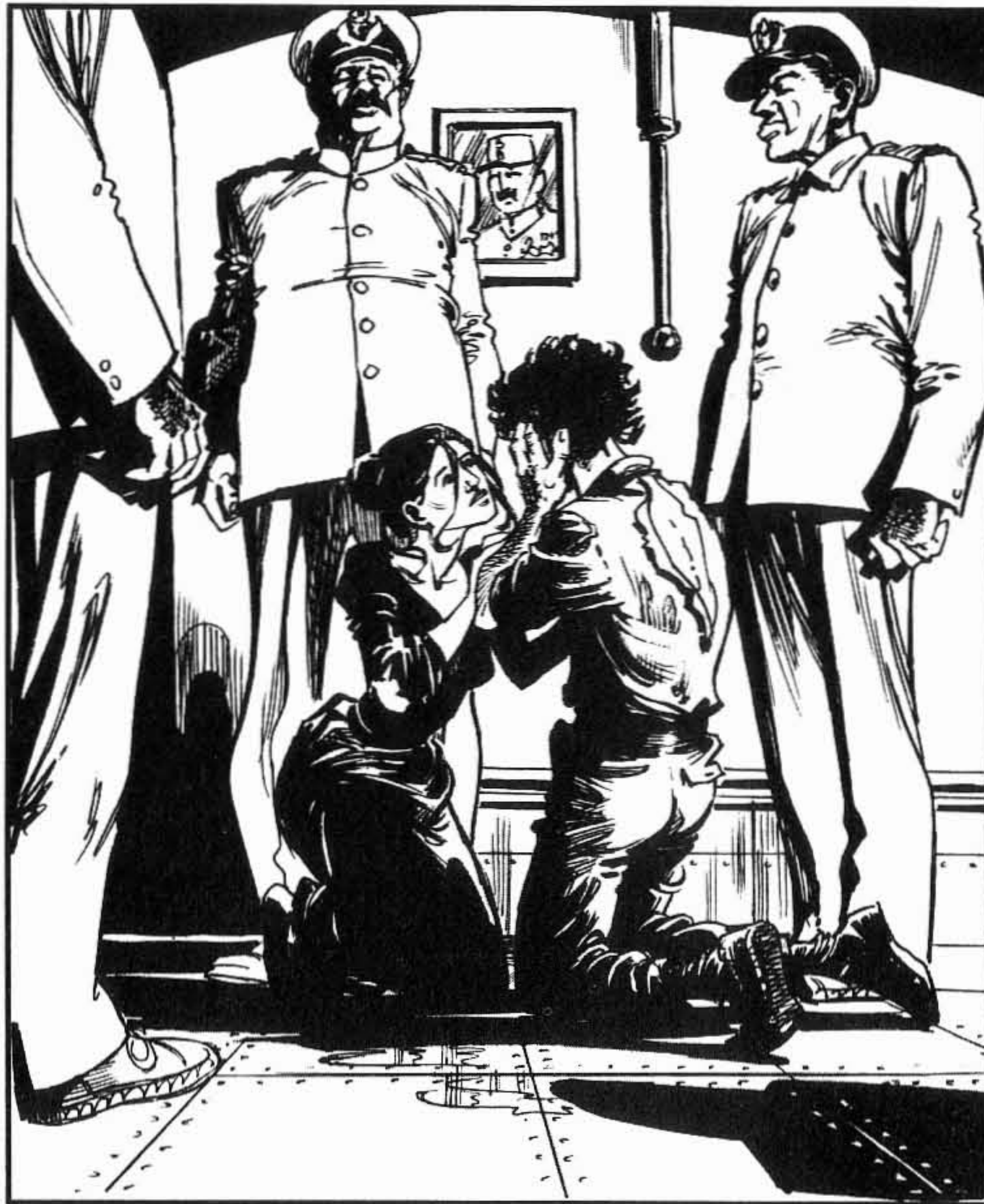
Rose went to Allnutt at once and knelt in front of him.

on his own ship. And in no time at all he had decided exactly what he was going to do with his prisoners.