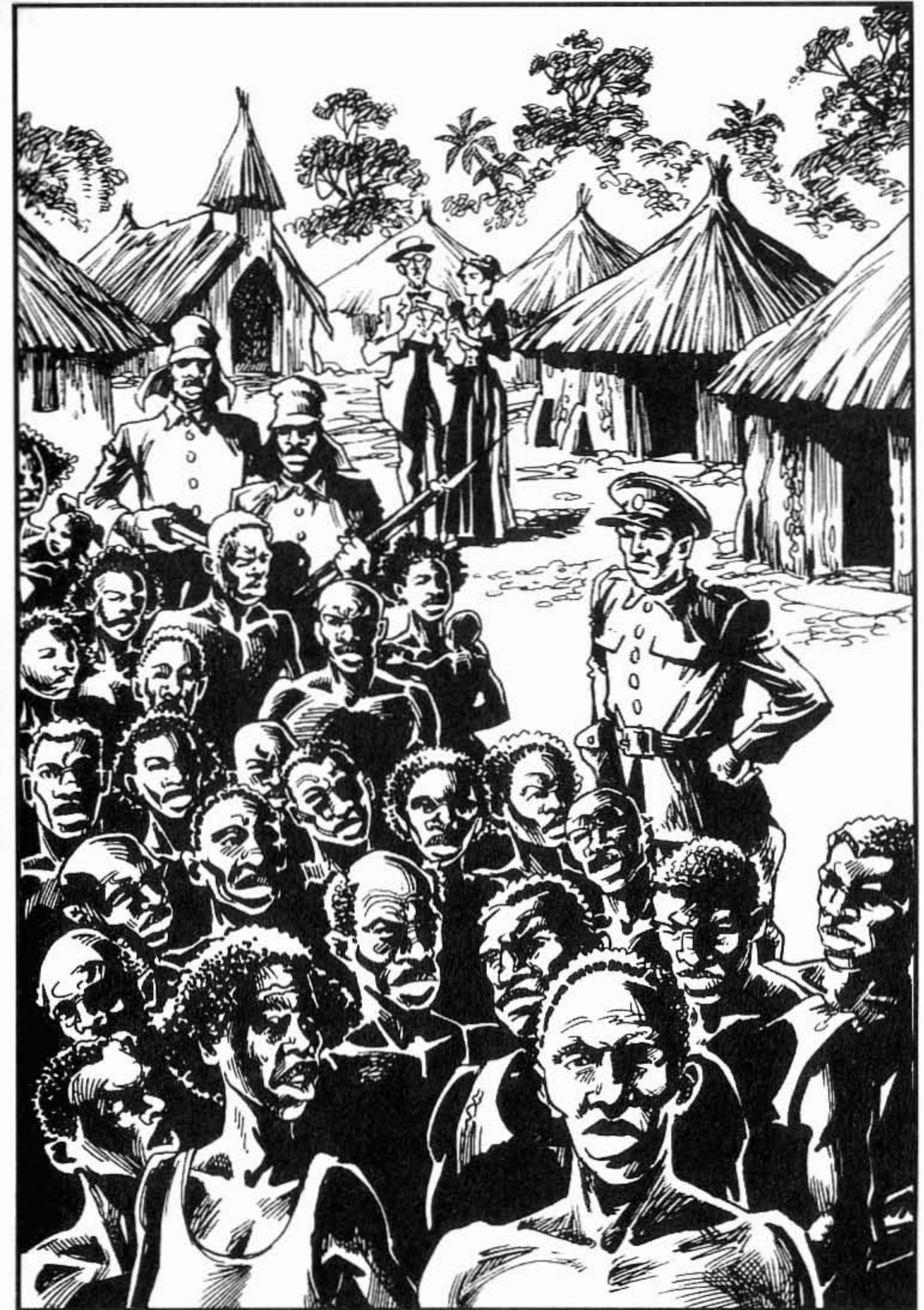
The German soldiers had taken all the villagers away.

'Oh God,' he prayed, 'help men to see that war is not the answer to their problems. Bring them, in the end, to a lasting peace. And God, look kindly on our brave country, England. Carry her safely through this most difficult time, and give her victory over the godless ones who are responsible for this disaster!' As he finished his prayer, Samuel sounded almost like a fighting man, and Rose had never admired her brother more. Tears fell through her fingers as she covered her face