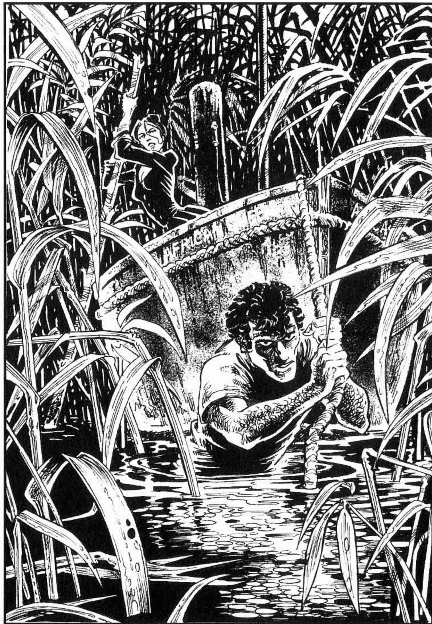
Allnutt tried to pull the boat along behind him.

‘All right,’ said Rose. ‘Give me the boat hook.’