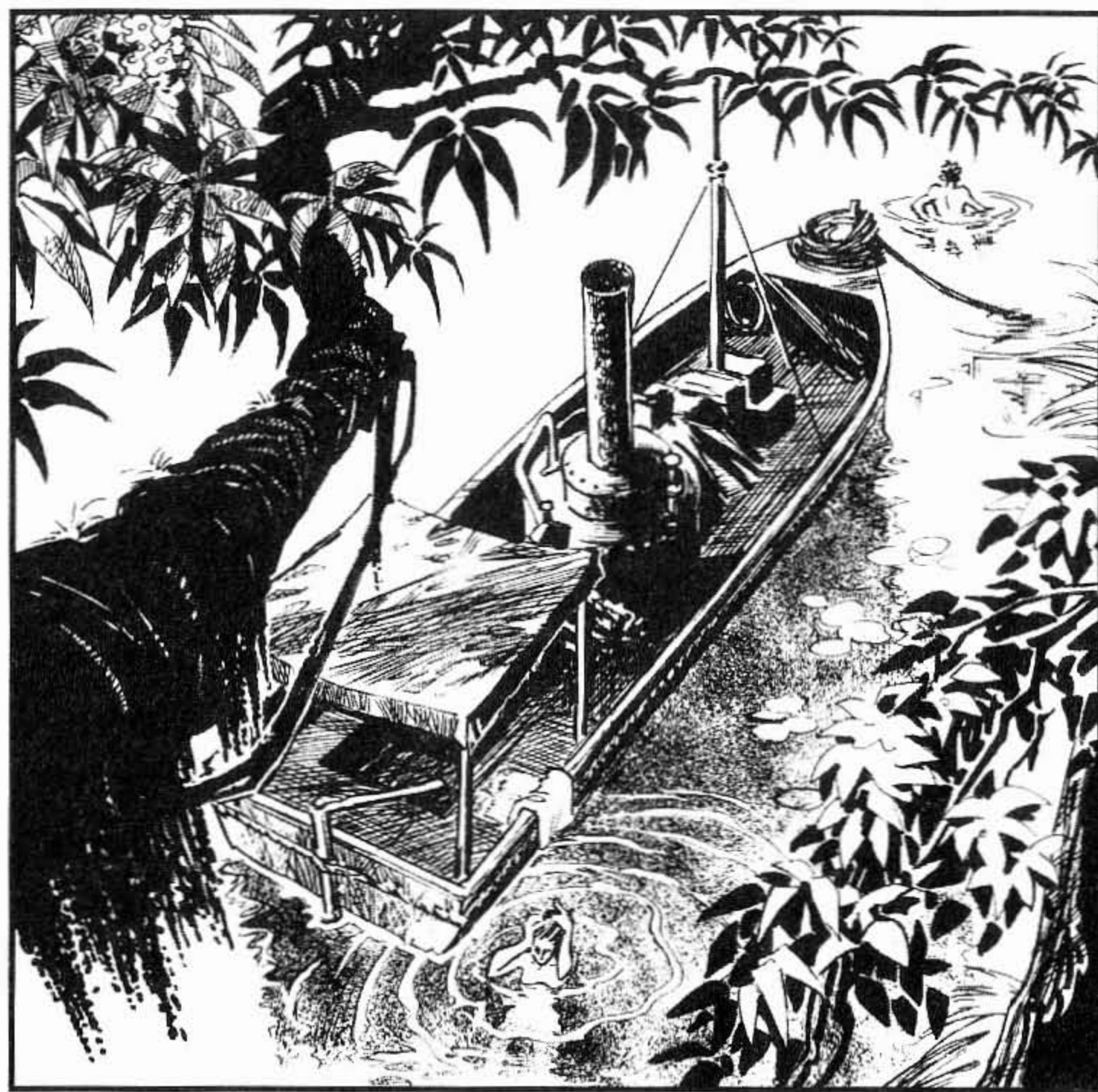
The water felt wonderfully cool on Rose's hot skin.

'No,' said Rose sharply. Her brother had spoken so often about the terrible effects of strong drink, but he had failed to