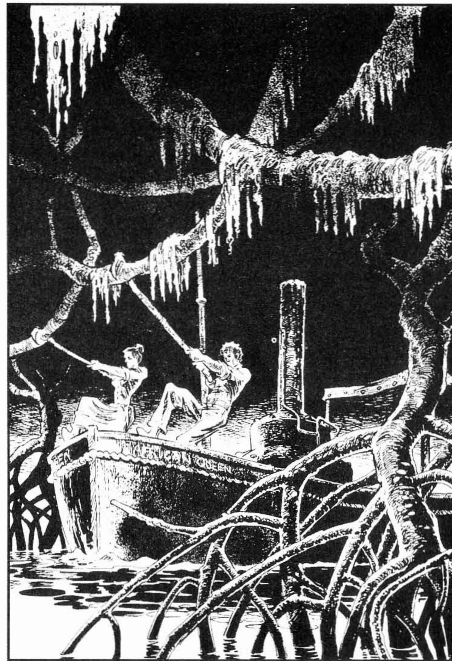
They lost all count of time in that dark mangrove swamp.

Then the channel took another turn, and in front of them was a view in which there were almost no mangroves.