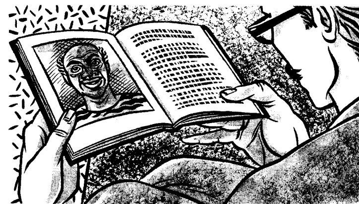
Baron Samedi, the strongest of the voodoo houngans.

‘Baron Samedi, the strongest and most dangerous of all the voodoo houngans. No one knows who Baron Samedi is, but they believe he is both dead and alive. He lives in two different worlds. Many people are so frightened of him that they are afraid to say his name.’