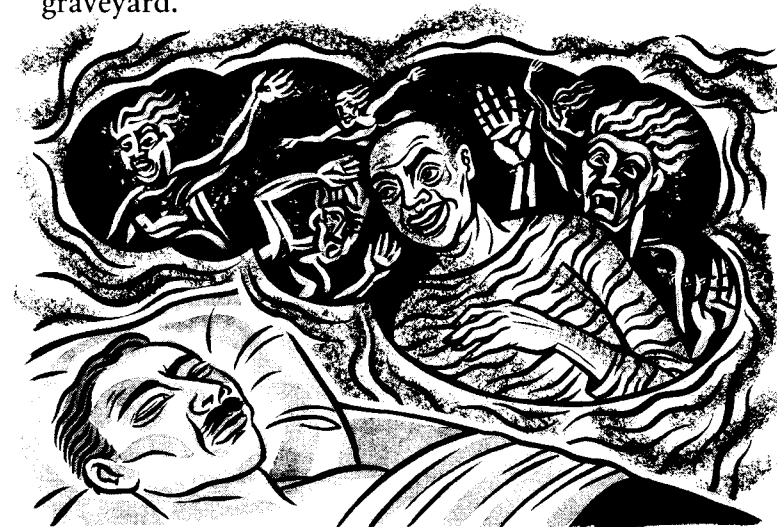
In his dream, Conway saw the spirits from the graveyard.

RRRRING! It was seven o'clock. Conway looked at his clock and got out of bed. He brushed his teeth. He was very tired after his bad night. But he washed his face with cold water, and he began to feel much better. He soon forgot about his dreams of Kee and the graveyard.