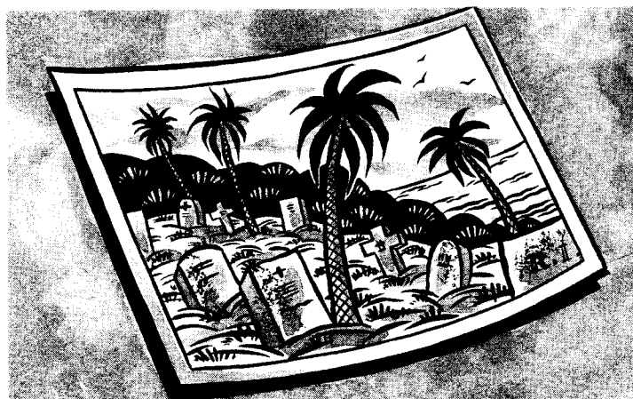
'I want to build on this graveyard.'

Jacques looked at the photograph carefully. 'It's very