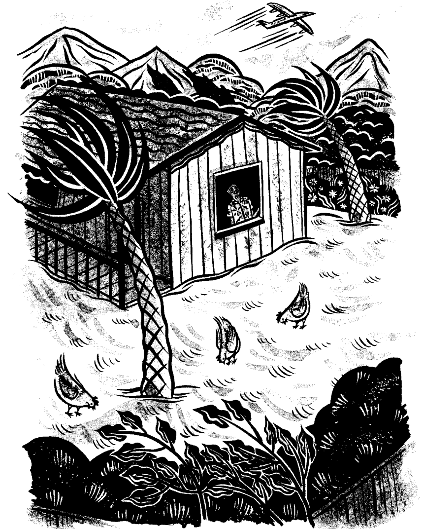
Kee was in his small wooden house among the trees.

'I can feel danger,' he thought. 'Someone bad is coming.' He looked out into the trees, but he couldn't