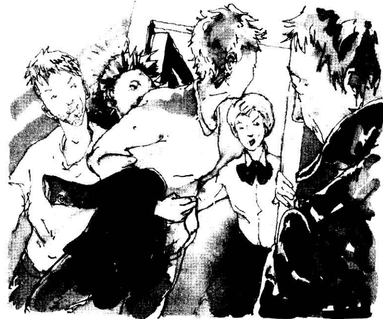
I knew my mother was angry, but I didn't care.

'All right,' I said. 'I want to forget what's happened. I want to forget what I've done and begin a new life, be a new person.'