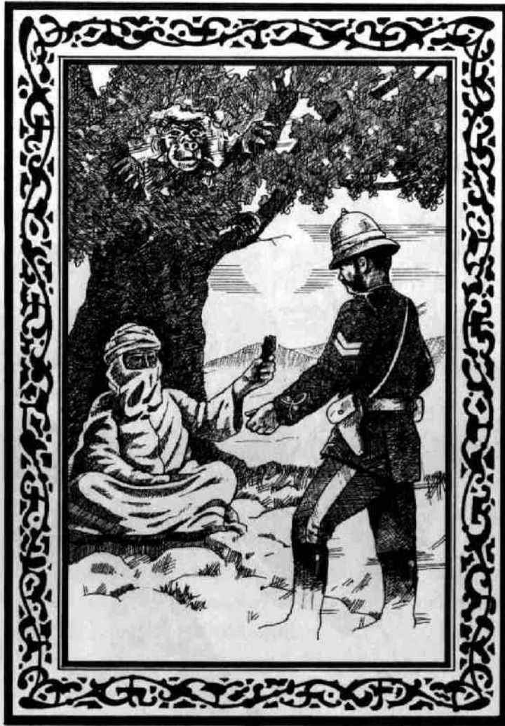
'An old Indian gave the monkey's paw to one of my friends.'

in India I saw many strange things.' He stopped talking for a minute and then he said, 'This monkey's paw can do strange and wonderful things. An old Indian gave the paw to one of my friends. My friend was a soldier too. This paw is magic because it can give three wishes to three people.'