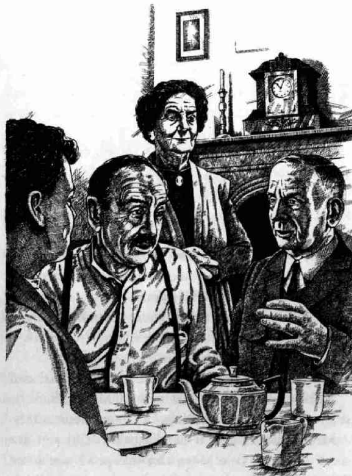
The soldier told the family many stories about India.

Then the old soldier put on his coat. He said goodbye to the White family, and went out into the rain.