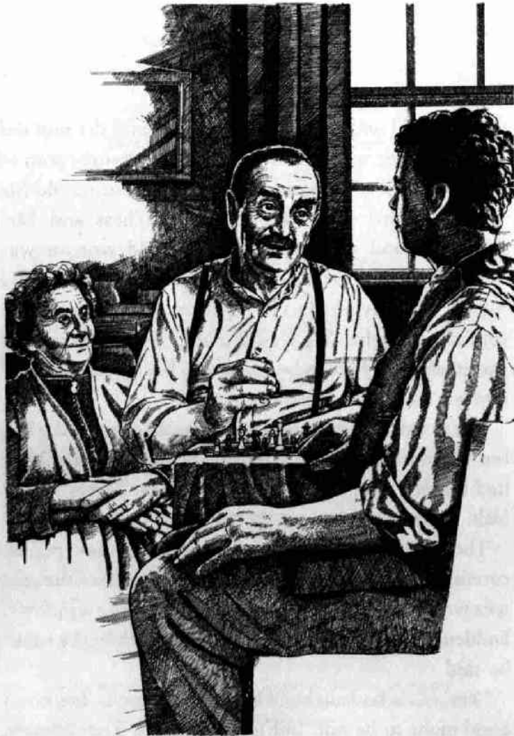
Old Mr White and his son played chess.

'Yes, that's right. He's coming at about seven o'clock,' the old man said. 'But perhaps this rain . . .'