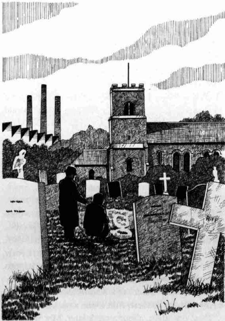
The two old people said goodbye to their dead son.

window and she watched and waited for her son. He did not come and she began to cry quietly.