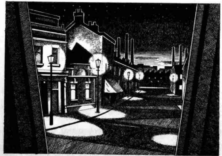
The road was dark and quiet.

At the same time Mr White took the monkey's paw