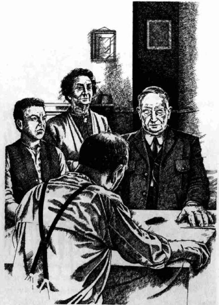
'The monkey's paw brings unhappiness with it.'

'What do I do now?' he asked his friend.