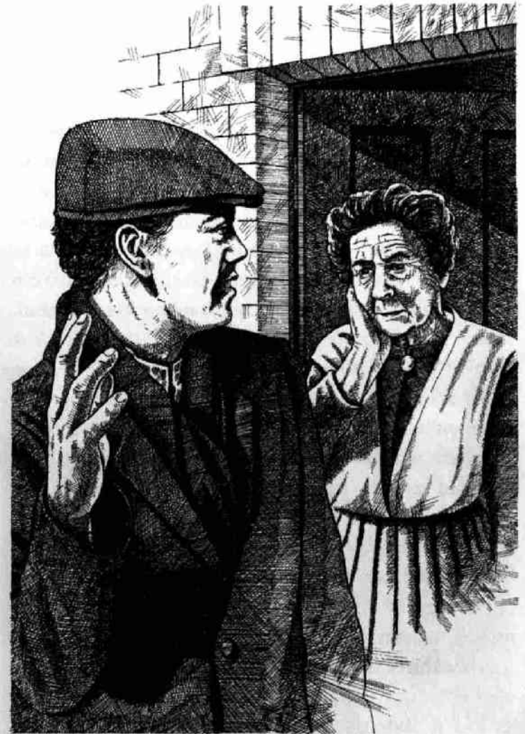
Mrs White stood at the door for some time.

Herbert left the house and walked quickly down the road. His mother stood at the door for some time and watched him. The winter sun was warm, but suddenly she felt very cold.