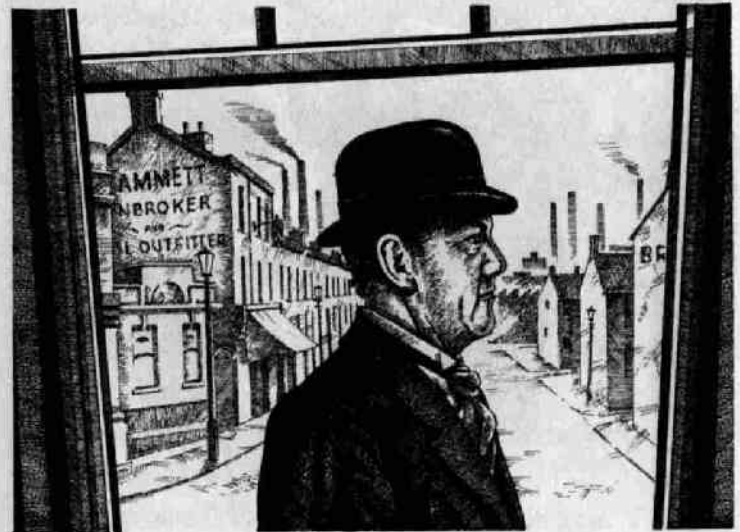
'There's a tall, well-dressed stranger in front of our house.'

'There's a man in front of our house,' Mrs White answered. 'He's a stranger – very tall – and well dressed.'