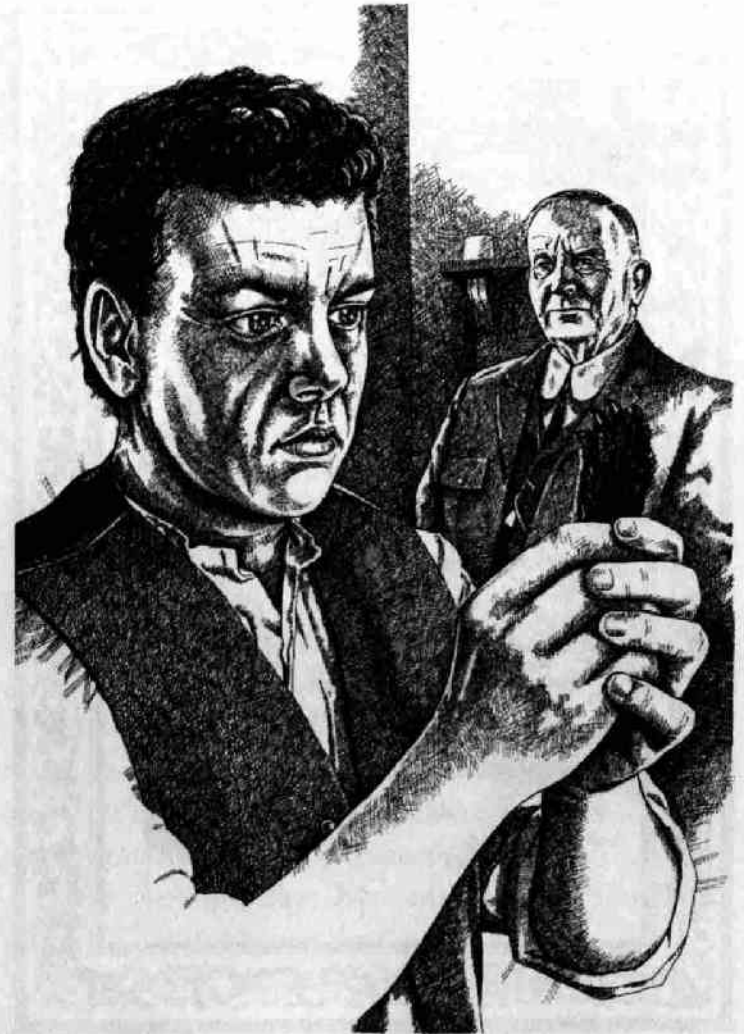
Herbert looked carefully at the monkey's paw.

Herbert laughed again, but the soldier said, 'Don't laugh, boy. Remember, you're young. I'm old now and